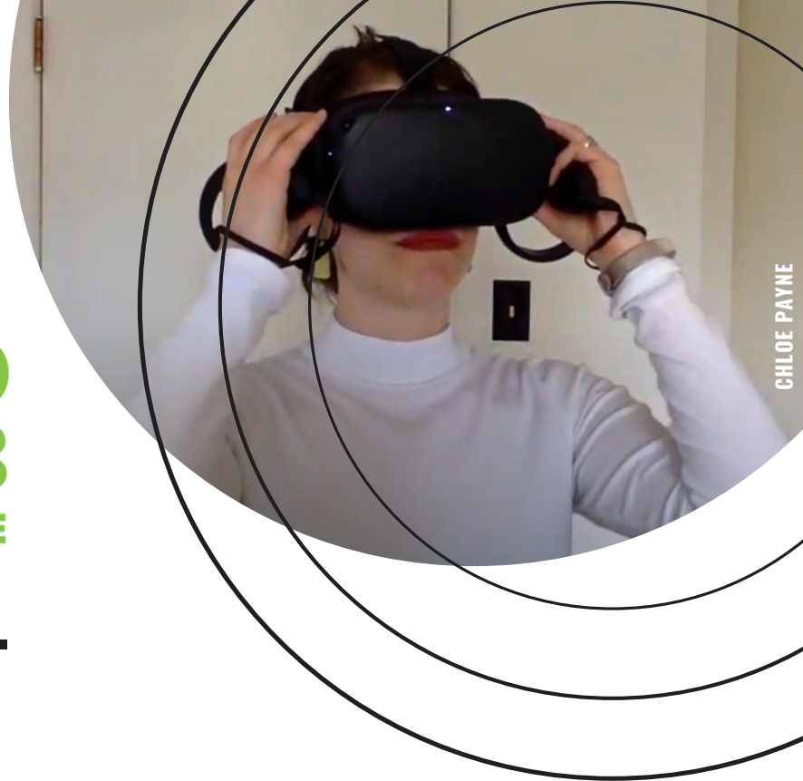
CHI OF PAYNE

Now in its fourth year, The PXR2023 Conference will expand on this successful foundation, prioritizing interactive, experiential presentations which innovate across the broad scope of mixed reality, building on the strengths of gathering in VR and designing spaces and experiences which optimize the content and the medium.